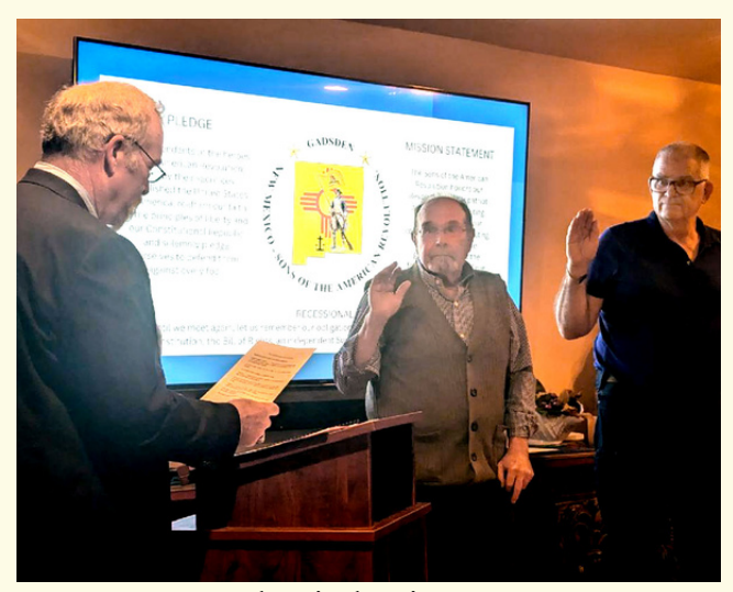
New member induction ceremony.

October 19th chapter meeting welcomes 2 new members!