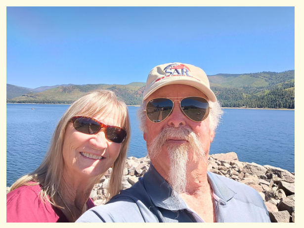
Vallecito Reservoir Vallecito, CO