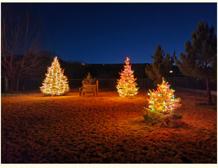
MERRY CHRISTMAS from ALTO, NM