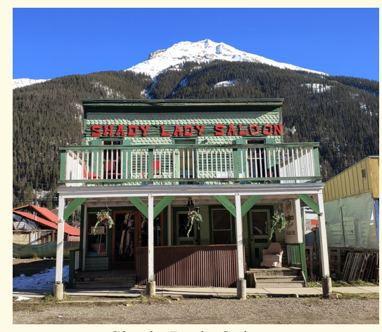
Shady Lady Saloon Silverton, CO (My patronage was not allowed)